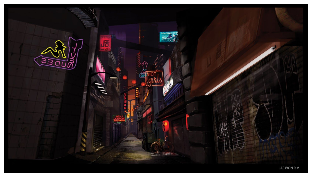
Red Light District 2030 Medium : Photoshop with using photo materials

Desciption : Inspired by Machine city from the film 'The Matrix' and Villian from 'Transformer'.