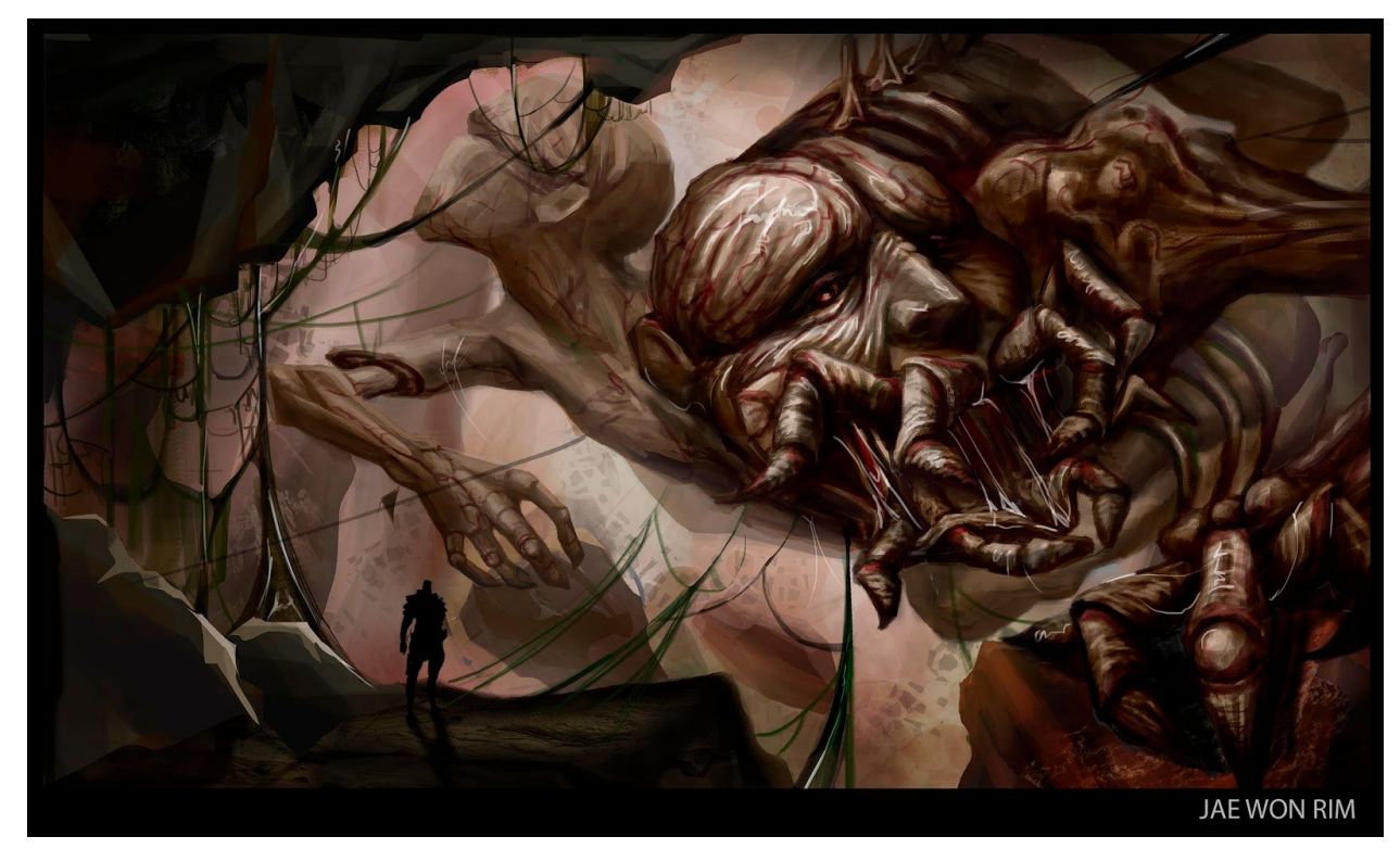
The Encounter Medium : Photoshop

The Nest 'Engine' Medium : Photoshop Desciption : Related to the concept 'The nest'. It is a engine room where the main energy source is